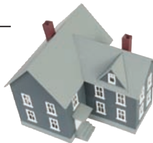
PILLAR TO POST® HOME INFORMATION SERIES